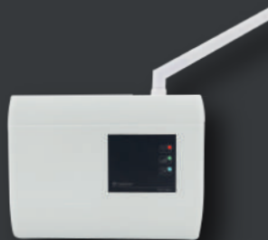
Universal Gsm Dialer